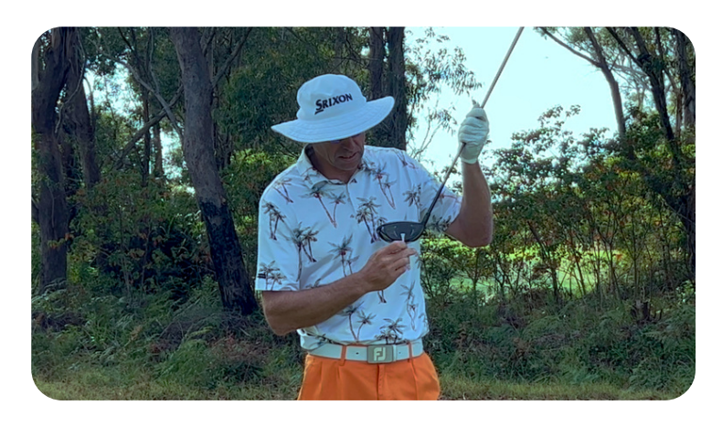
Step 2 - As you consider your ideal setup, you should choose your tee wisely. A tall tee is perfect for bombing long drives but isn't necessarily the most accurate. For those tight tee shots, especially into the wind, select a tee which is quite short.

Aim for something in the distance, such as a telegraph pole, a tree or even a tree branch!