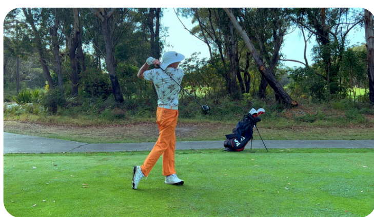
Step 5 - The one aspect which should not change on tight tee shots, is your level of commitment to your drive.

This also keeps the ball flight lower into the wind and increases your chances of hitting the fairway.