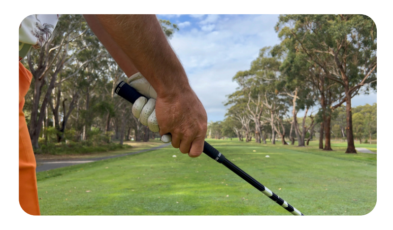
Step 4 - Another adjustment to improve accuracy and lower the ball flight, is to lower the hands on your grip. 'Choking' down the grip an inch or so, effectively stiffens the shaft and shortens your swing arc.

This will have the effect of shortening the backswing, which will in turn help produce a low, penetrating ball flight into the wind.